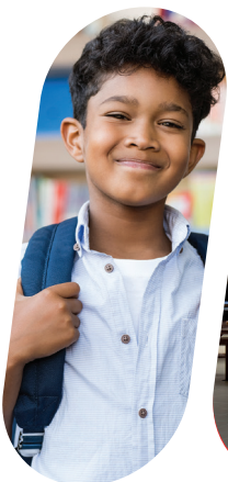
K-12 / Higher Ed